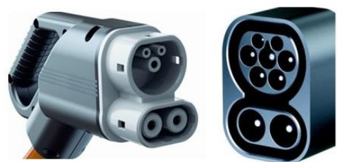
CCS2 charging plug and socket

The I-Pace is fitted with a CCS2 socket allowing it to charge via AC as well as via CCS2 DC fast-chargers.