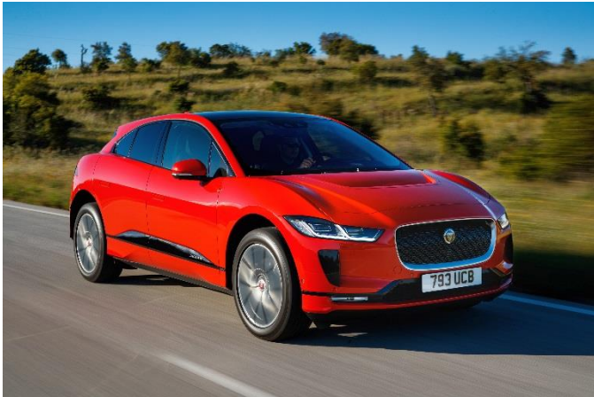
Jaguar I-Pace.